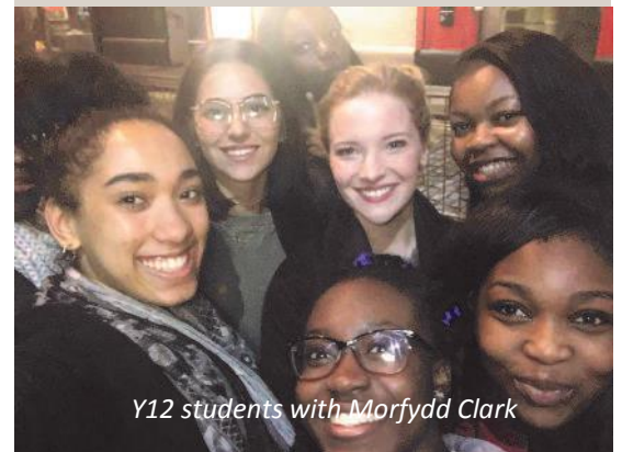
Y12 students with Morfydd Clark

In January, our Year 12 students attended a production of Les Liaisons Dangereuses at the Donmar Warehouse theatre in Covent Garden. It was a production of exceptional quality which was loved and appreciated by the girls. Students also had the privilege of meeting some of the cast (below). Prior the show, students experienced a workshop exploring the text that helped them to understand the key themes and complexity of the main characters.