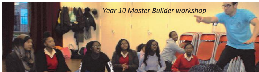
Year 10 Master Builder workshop

At the end of April, Year 11 students will perform in their final practical examination, sharing a piece of drama that explores 'consequences'. The girls have been rehearsing outside of lessons and will give a sneak preview of their work in March in front of an invited audience.